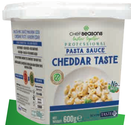
PASTA SAUCE MIX CHEDDAR TASTE