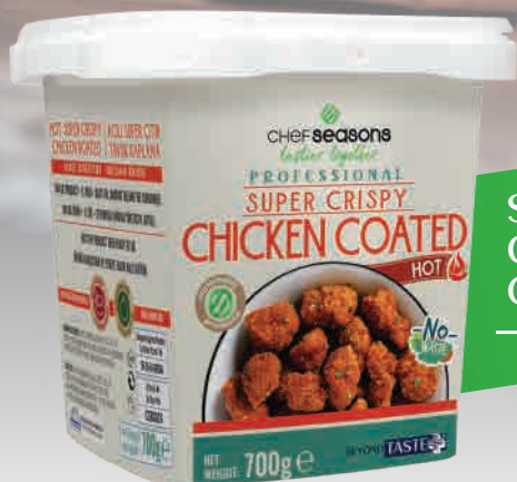
SUPER CRISPY CHICKEN COAT - HOT