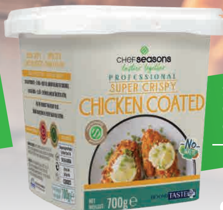
SUPER CRISPY CHICKEN COAT