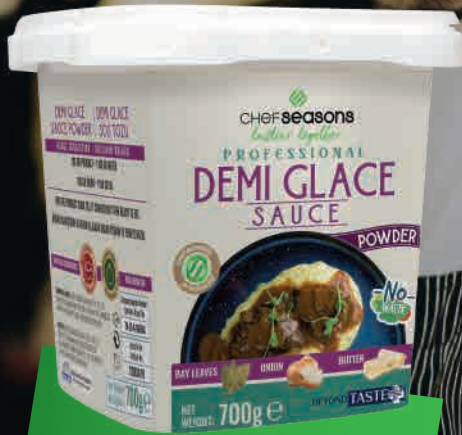
DEMI GLACE SAUCE POWDER