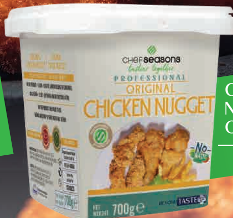
CHICKEN NUGGET ORIGINAL