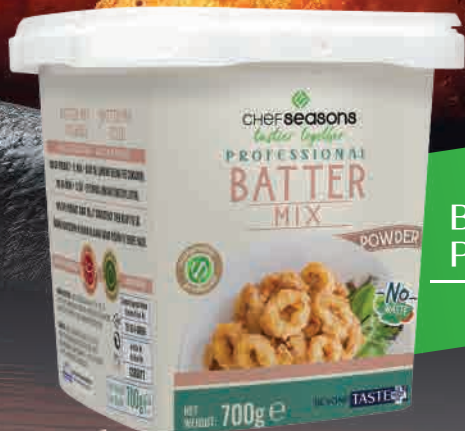
BATTER MIX POWDER