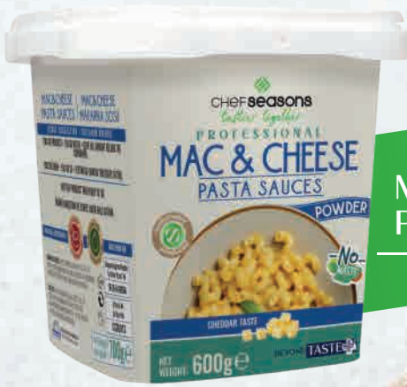
MAC&CHEESE PASTA SAUCES