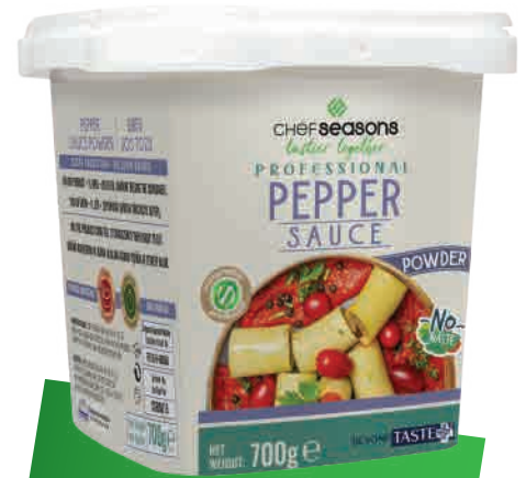
PEPPER SAUCE POWDER