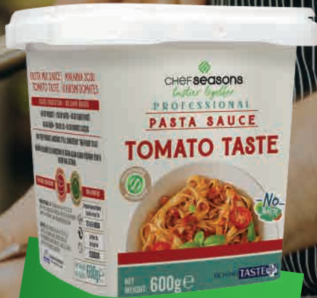
PASTA SAUCE MIX TOMATO TASTE