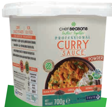
CURRY SAUCE POWDER