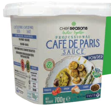
CAFÈ DE PARIS SAUCE POWDER