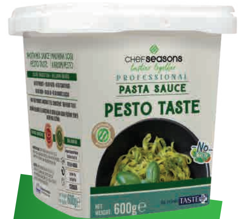
PASTA SAUCE MIX PESTO TASTE